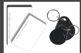
RFID Cards & Tags